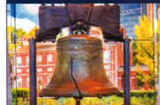
Take a visit to Philadelphia