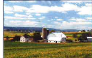
Enjoy the Picturesque Views of Lancaster