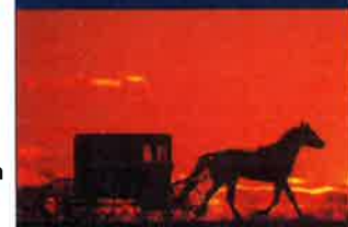
Experience the Amish lifestyle

Departure: Covenant United Methodist Church, 3610 West Main St, Dothan, AL @ 8 am